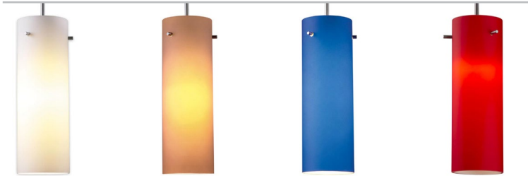
805 white 806 amber 807 blue 808 red