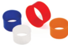
Translucent Decorative Collar