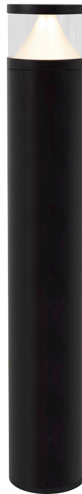
ARKAY THREE BOLLARD shown in black