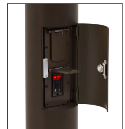
Shown with optional GFCI outlets