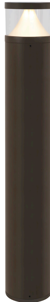
ARKAY THREE BOLLARD shown in bronze