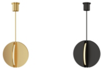
natural brass nightshade black