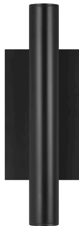
CHARA 12 OUTDOOR WALL shown in black