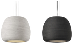
concrete/white large black/black large