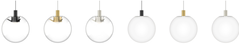
clear / matte black clear / natural brass clear / satin nickel white / matte black white / natural brass white / satin nickel