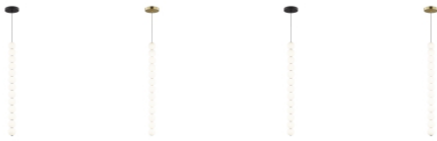
nightshade black alt view natural brass nightshade black natural brass alt view