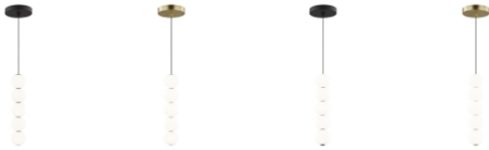
nightshade black natural brass nightshade black alt view natural brass alt view