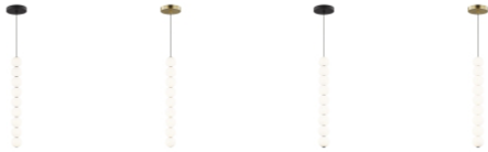
nightshade black natural brass nightshade black alt view natural brass alt view