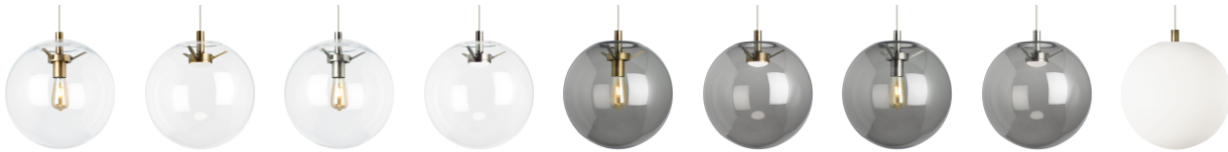
clear / aged brass clear / aged brass clear / satin nickel clear / satin nickel smoke / aged brass incandescent smoke / aged brass led smoke / satin nickel incandescent smoke / satin nickel led white / aged brass