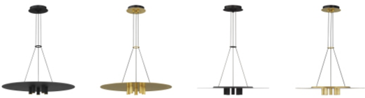
nightshade black natural brass nightshade black alt angle natural brass alt view