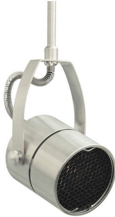
With Eggcrate Louver