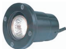
CL-324, BK, BR, NM, SS