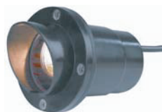
CL-325, BK, BR, NM, SS