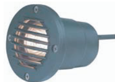
CL-326, BK, BR, NM, SS