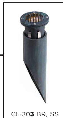
CL-303 BR, SS