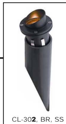
CL-302, BR, SS