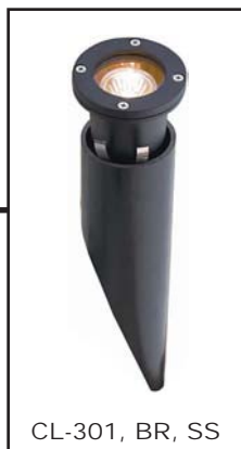
CL-301, BR, SS