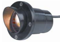
CL-325, BR, NM, SS