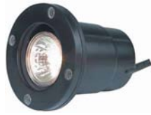
CL-324, BR, NM, SS