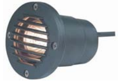
CL-326, BR, NM, SS