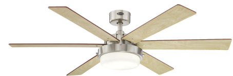
Reversible Light Maple Finish Blades