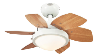
Reversible Beech Finish Blades