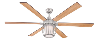
Reversible Beech Finish Blades