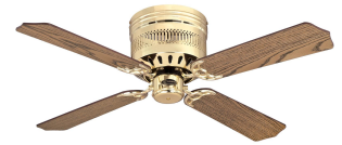
Reversible Oak Finish Blades