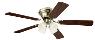
Reversible Walnut Finish Blades