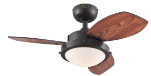
Reversible Dark Cherry Finish Blades