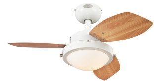
Reversible Beech Finish Blades