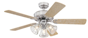
Reversible Bird's Eye Maple Finish Blades