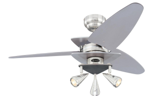
Reversible Silver Finish Blades