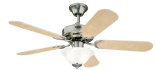
Reversible Light Maple Finish Blades