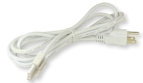
72" Cord and Plug

NUA-804B Black NUA-804W White Used to hardwire NUDTW-88 fixtures to NUA-802 or junction box (by others)