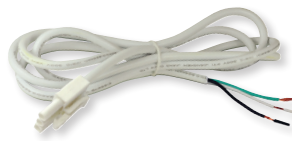
72" 3-Wire Hardwire Connector

NUA-803 White Used to join two NUDTW-88 fixtures seamlessly together. One connector is included with each luminaire