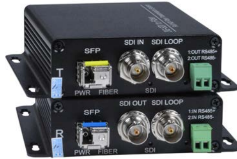
XTENDEX® ST-1FO3GSDI-LC (Local and Remote Unit)