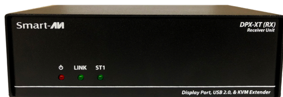
DPX-XT (RX) Front