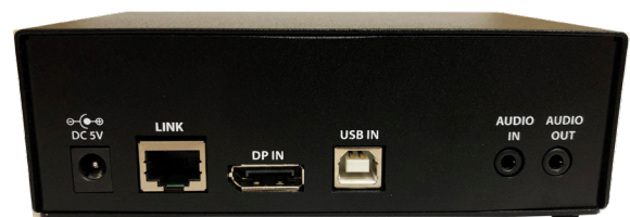
DPX-XT (TX) Back