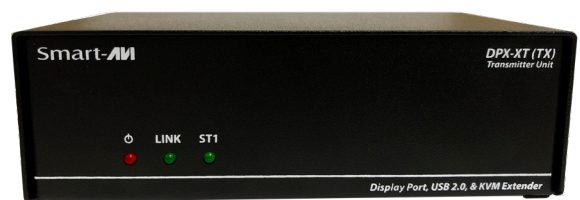
DPX-XT (TX) Front