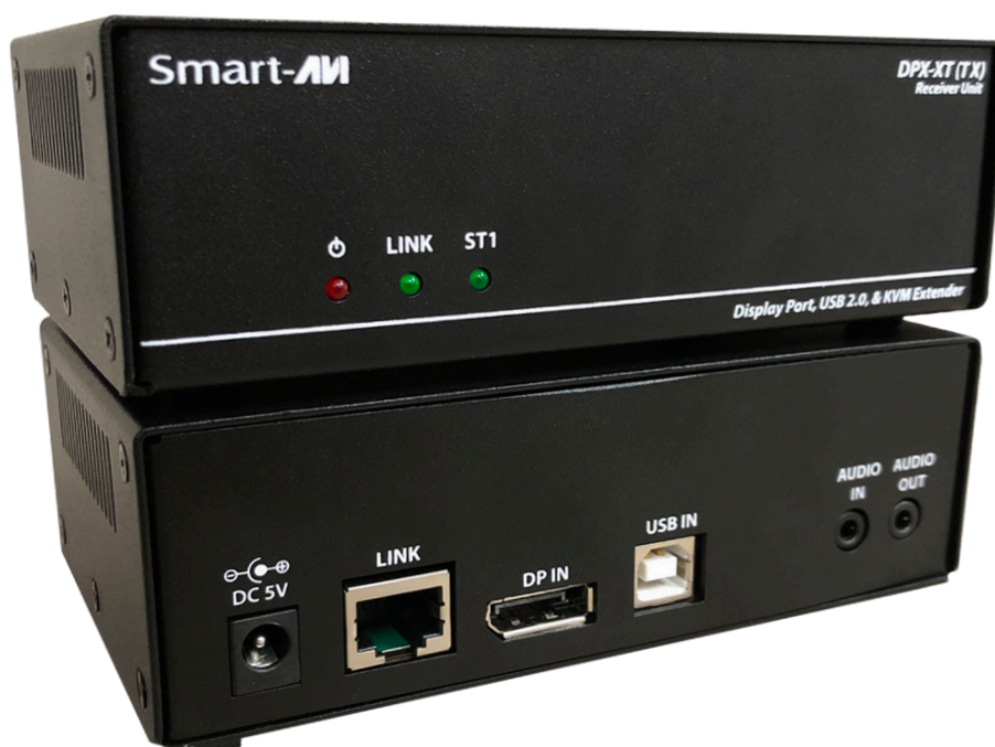
DPX-XT (TX) Front