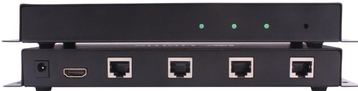
HDX-400-Pro Front and Rear