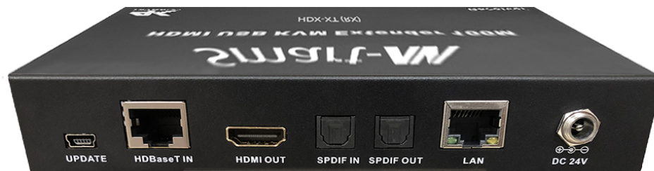
HDX-XT (TX) REAR