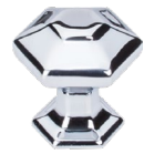
1" Knob Polished Chrome