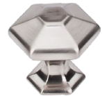
1 1 / 8 " Knob Brushed Satin Nickel