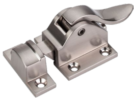
Brushed Satin Nickel