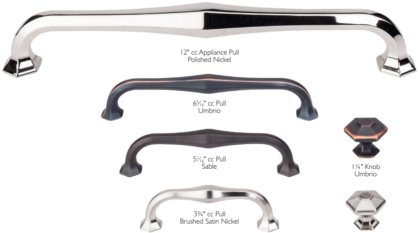
12" cc Appliance Pull Polished Nickel