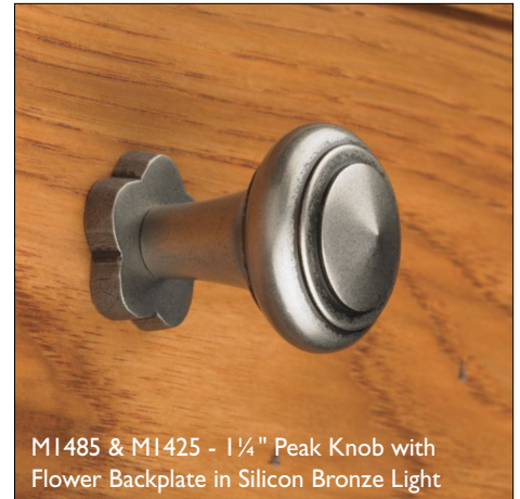
M1485 & M1425 - 1¼" Peak Knob with Flower Backplate in Silicon Bronze Light