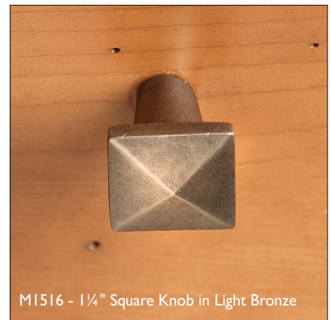
M1516 - 1¼" Square Knob in Light Bronze

Part Number is specific to shape and finish. cc = measurement center-to-center between the screw holes.