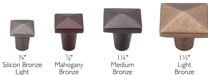
¾" Silicon Bronze Light