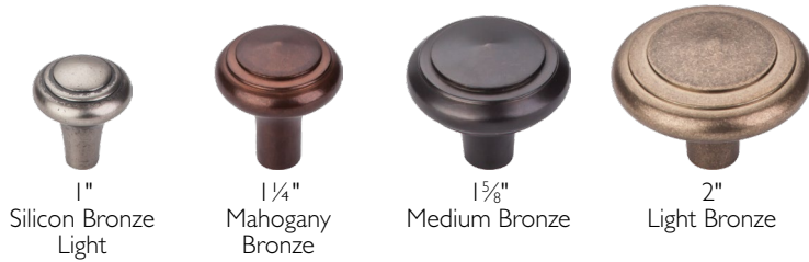
1" Silicon Bronze Light