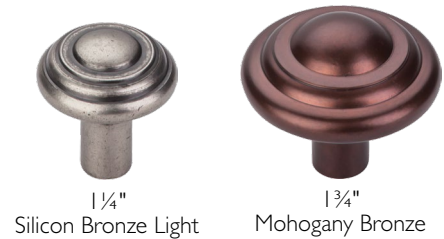
1¼" Silicon Bronze Light