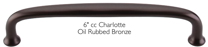
6" cc Charlotte Oil Rubbed Bronze