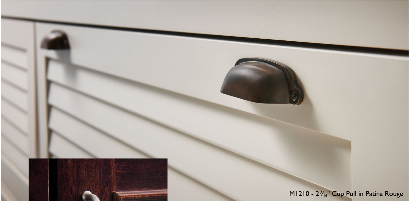
M1210 - 2 \frac{5}{16} " Cup Pull in Patina Rouge