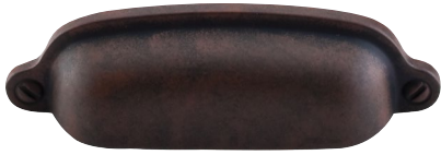
2 \frac{5}{16} " cc Cup Pull Patina Rouge