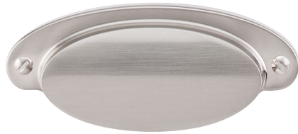
2 7 / 16 " cc Dakota Cup Pull Brushed Satin Nickel