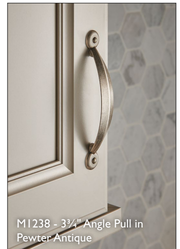
M1238 - 3 3 / 4 " Angle Pull in Pewter Antique