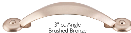
3" cc Angle Brushed Bronze