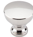
1 1 / 4 " Bergen Knob Polished Nickel