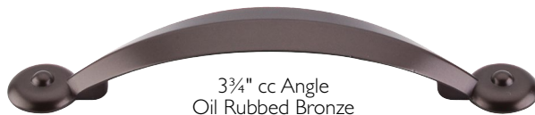
3 3 / 4 " cc Angle Oil Rubbed Bronze