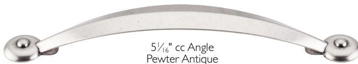
5 1 / 16 " cc Angle Pewter Antique