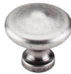
1 5 / 16 " Peak Knob Pewter Antique