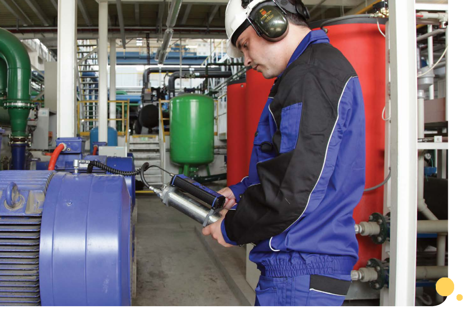
Easy to use: - One button operation - No instrument set up - Colour graphic display