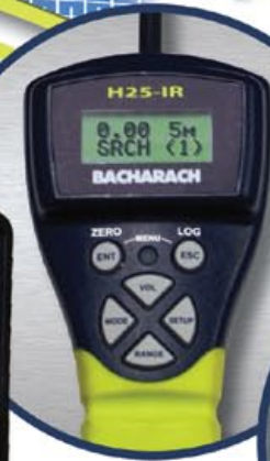
Optional Smart Probe