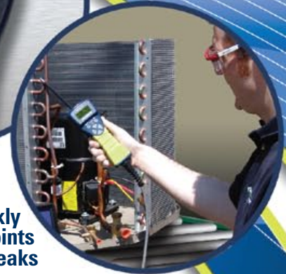
Quickly Pinpoints Leaks