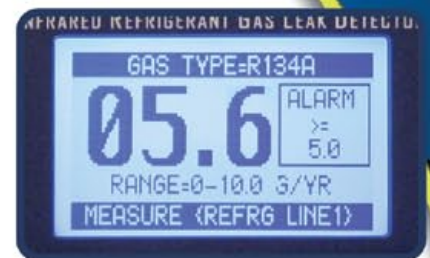
With Exclusive Numeric Leak Rate Display