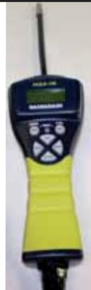
Standard Probe LED & Button

Smart Probe Contains an LCD display that shows the current leak rate. Also contains an LED that can be configured for operation just as with the Standard Probe, LED & Button. The probe also has a keypad that is identical to the one on the H25-IR's front panel, enabling all of the instrument's functions, setups and features to be accessed via the probe.