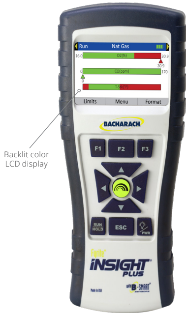
Backlit color LCD display

Automatic delivery of precalibrated sensors to your door to eliminate field calibration and minimize maintenance