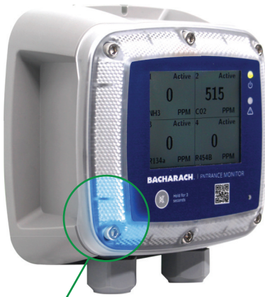
Perimeter Strobe Alarm Status Indication

For Commercial & Industrial Applications