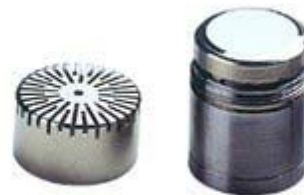
CEL-251 microphone capsule

Single level acoustic calibrator Class 1 (114 dB at 1 kHz)