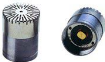
CEL-251 microphone capsule

The CEL-251 microphone is the best choice for use in ANSI and IEC61672 Class 1 Sound Level Meters and other noise measurements requiring Class 1 (or precision) accuracy. It is a 1/2" prepolarized free-field measurement microphone whose development spans over 30 years in design, manufacture, calibration, and field-testing. Every capsule is supplied with an individual calibration chart specific to that microphone.