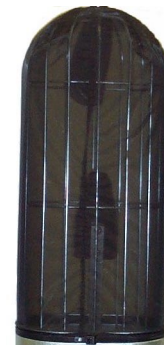
CEL-6736 replacement wind sock and fixing strap