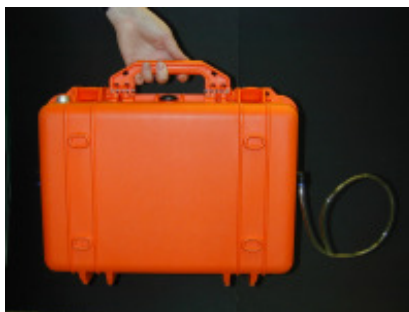
Casella HazVac kit case with inlet sampling tube

The HazVac Air Sampling unit has been developed and manufactured by Casella CEL for obtaining safe grab samples of toxic gases and vapors at chemical spillages and incidents. Based on the popular Casella APEX pump, the HazVac unit is a watertight and airtight sampling system for obtaining gases and vapors in hazardous environments with zero contact between the sample and the pump.