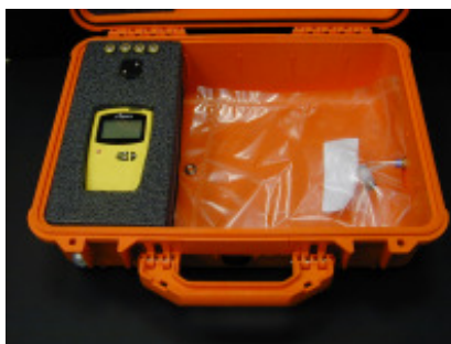
inside HazVac case showing Apex pump and sampling bag ready for collection of unknown gas

The unit is set-up for ease of operation with activation by a single external push button that has an indicator light. Once activated, the pump will remove air from the hermetically sealed case, drawing a sample into the gas bag. The pump can be set to sample for a set time prior to operation. The sampling case is fully dust, gas and water tight and is constructed from inert resin material enabling the unit to be decontaminated using a shower, a hose line or by a physical wipe down.