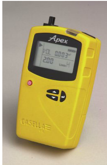
UL, ATEX, ANSI, CSA approved for use in hazardous areas