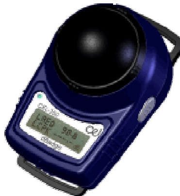
CEL-350 dBadge dosimeter

The CEL-35X Plugin for Casella Insight allows the run data from dBadge dosimeters to be transferred to the database for archiving and reporting. All the results from the dBadges can be viewed and printed as required to suit national requirements or for customized output for specific purposes. Personal noise data can be linked with sound level meter results to produce a comprehensive report that documents noise exposure by site, location or by person.