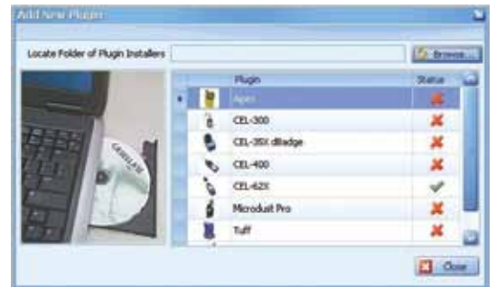
Adding additional instruments

Users of existing Casella software packages can import previously downloaded data. Likewise, data within Casella insight can easily be exported and sent to other colleagues or users, allowing data to easily be shared across organisations.