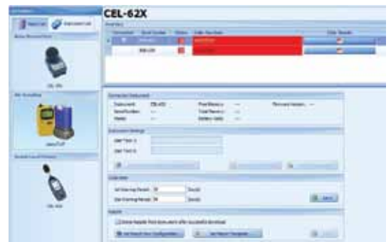
Instrument calibration and configuration screen