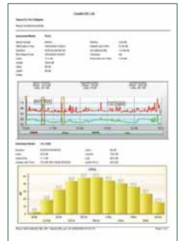
Reports can be generated to include dust and noise results together, for example