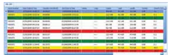
Exposure data can be automatically colour coded according to exceeded action levels

Graphs can be further analysed by adding zones (shown right) which subsequently provides exposure levels inside and outside these zones. This allows the exclusion of extraneous events, breaks etc to provide comparative exposure calculations. Any exclusion zones added to data are retained with the data file.