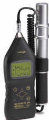
Microdust Pro real time dust monitor

This Plugin can be installed with any others that are available to link all instrument measurements together for a complete industrial hygiene report.