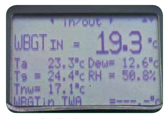
Numerical Real-Time Display