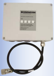
Accessory Enclosure allows connection of mV Bridge type flammable gas detectors.