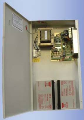
Auxiliary Power Unit provides extended back-up in the event of mains power failure.