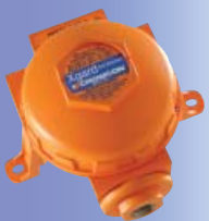
Industry-standard gas detectors