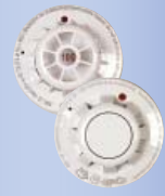
Up to 20 fire/heat detectors per zone