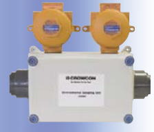
Sampling Device control for Crowcon's Environmental Sampling Unit