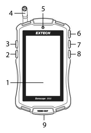
Figure 1.1 Product Description